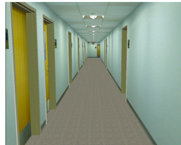
Figure 1: the virtual hallway environment used in the experiment.

(for ordinary walking). The navigation methods were presented in a balanced order between subjects using Latin squares and we explicitly avoided describing the methods in any way, not even by name, to avoid inadvertently biasing or otherwise influencing participants' opinions or ratings. At the beginning of each trial, participants were simply instructed to point the wand, which was also tracked with the HiBall system, in the direction they wished to travel, press the trigger (which activated the augmentation of the tracker output in modes B and G, and controlled the direction and duration of travel in mode J), and, except in the case of method J, to begin walking. After traversing the hallway from end to end using each navigation method, participants were given a short survey in which they were asked to 1) identify the methods that they liked best and least overall; 2) rate each of the methods on a seven point scale according to various criteria; and 3) provide written comments relating what they liked and didn't like about each navigation method. We created separate surveys for each possible presentation order, so that each participant would answer the questions about the methods in the order that s/he had experienced them (to minimize any opportunity for confusion between methods).