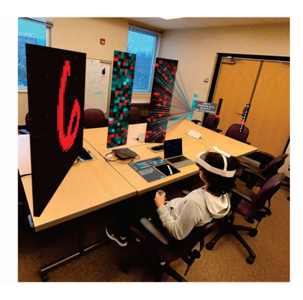
Figure 1: Second-person frame captures of our XR Environment for Al Education. The learner wears an XR headset to see an interactive visualization of a convolutional neural network for hand-written digit recognition. The visualization is integrated into the learner's view of the real world. The visualization is adjustable, here increasing in size from left to right.