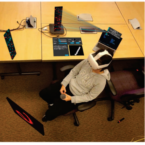
Figure 2: Neural network visualization deployed in front of the learner (top), and all around the learner (bottom).

can provide an adequately low visualization density for complex networks.