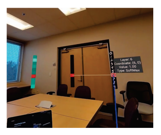
Figure 3: Frame captured from the learner's XR headset. The learner uses the virtual laser pointer (blue) to probe the firing value of neuron "6" of the SoftMax layer. The value is 1.0, indicating the correct classification of the input image (see Figure 1).

can provide an adequately low visualization density for complex networks.